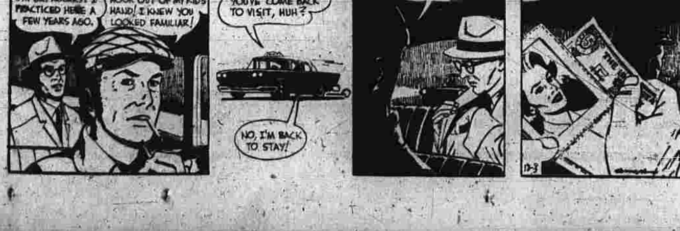
THE STORY OF MARTHA WAYNE