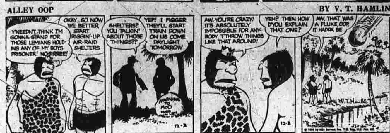
BY V. T. HAMLIN