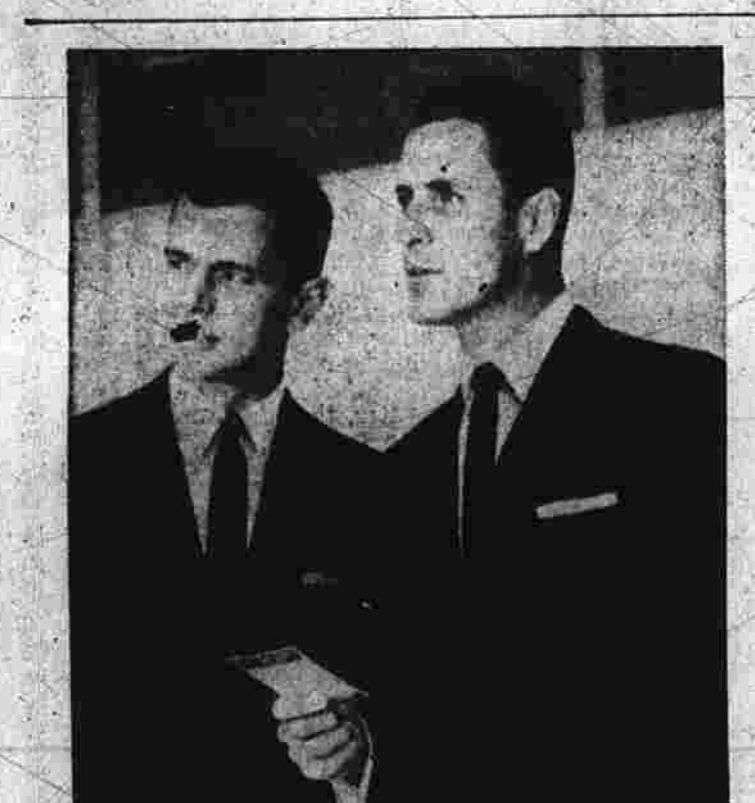
Mr. ... (Name partially obscured) ...

The Consolidation and Charter Commission voted last night to ask for an appropriation of $5,200 for the services of a professional consultant in drafting a charter.