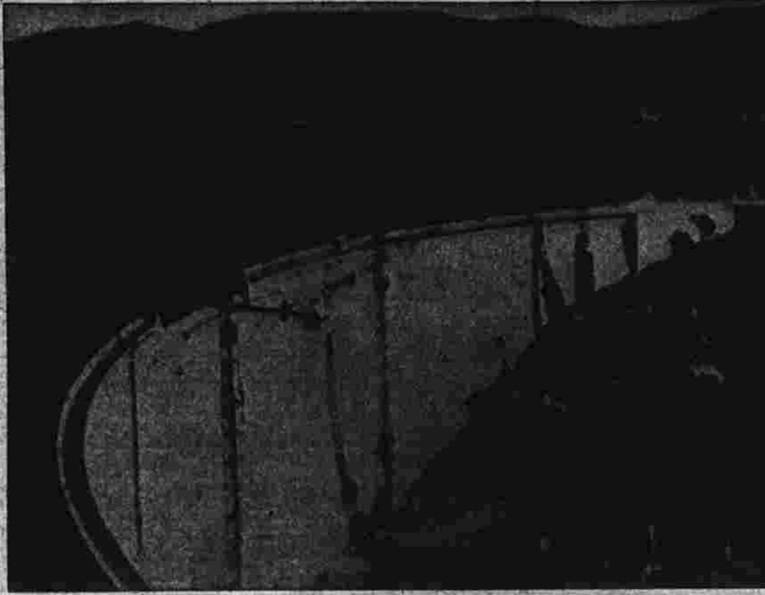
This is how the Malpasset Dam appeared before it broke.