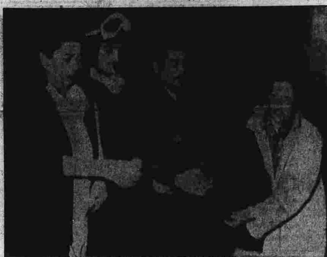
Unidentified rescuers remove body of flood victim at Frejus, France.